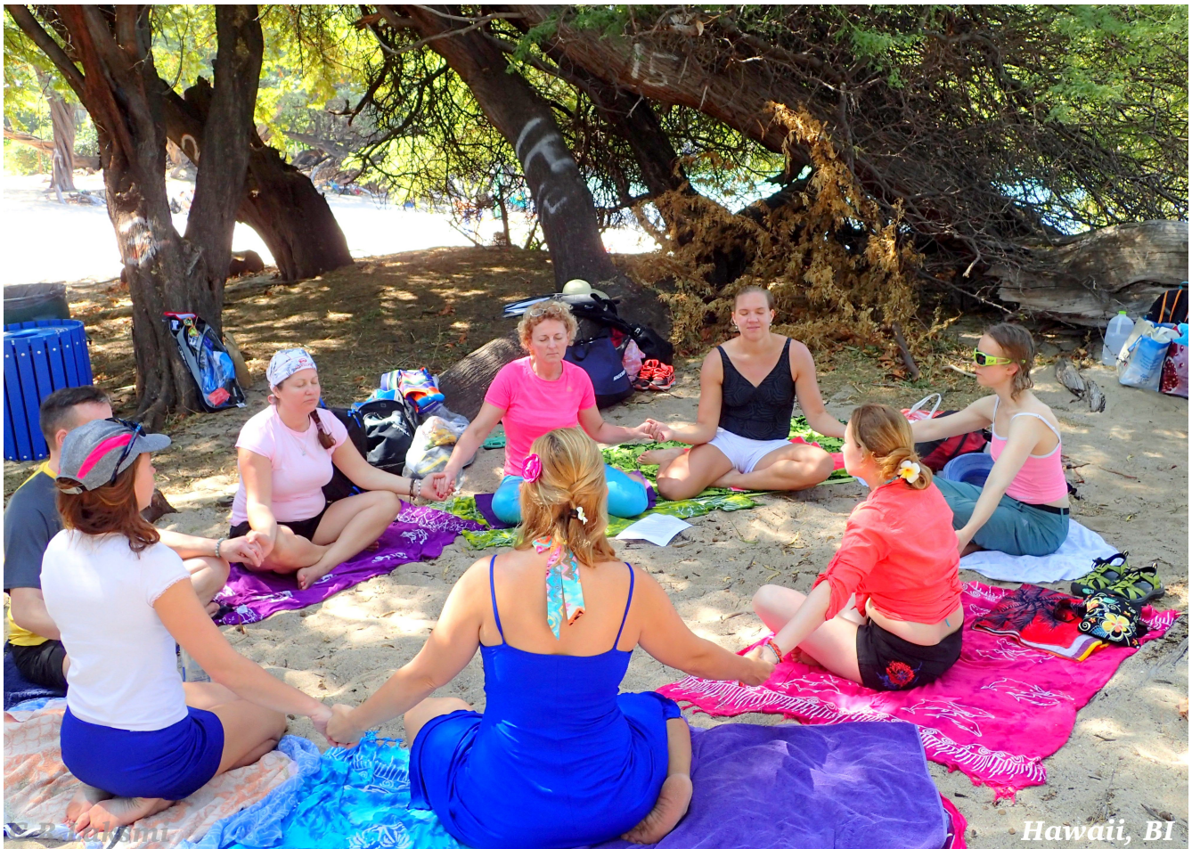
Beach 69 Meditation

* No pocket money or one to one sessions or any add ons included in the estimated total