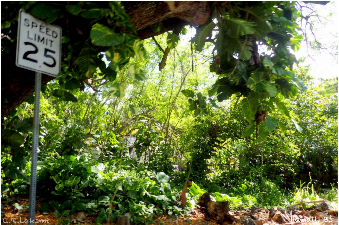
Jungle Road in Puna District

2. We head to the National Volcano park early the next morning. We visit the volcano park and do a little rainforest walk with a special welcome and mindfulness presence. We also walk through the Thurston lava tube. We arrive in Puna to our lava sanctuary accommodation and if there is time we will visit the local natural hot ponds.