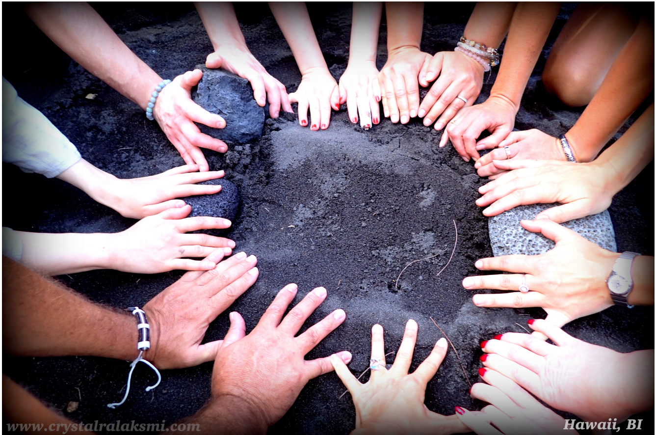
Waipio Valley Stone Ritual for Ancestors

More info can be ordered by email crystalralaksmi@gmail.com