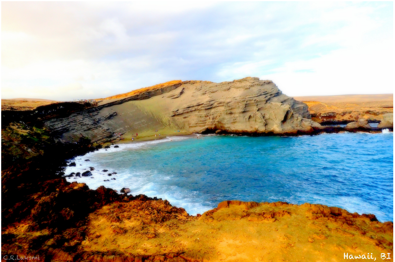
Green Sand Beach

park. Dinner in Hilo, the capital of the island.