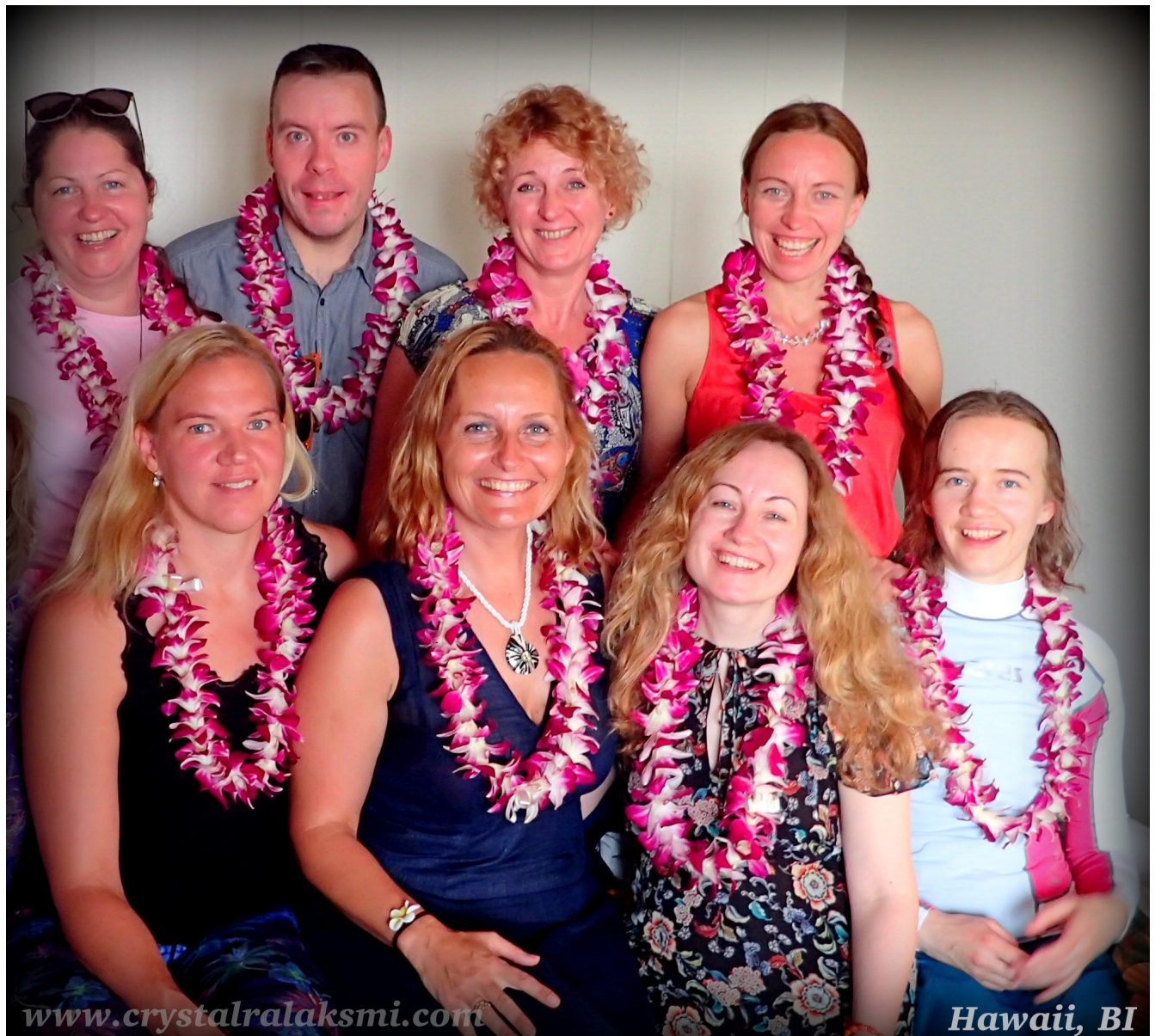
Adventure Retreat of 2016