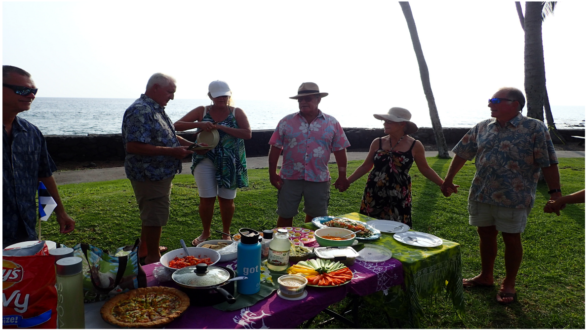
Potluck dinner in one of the beach parks in Kailua-Kona