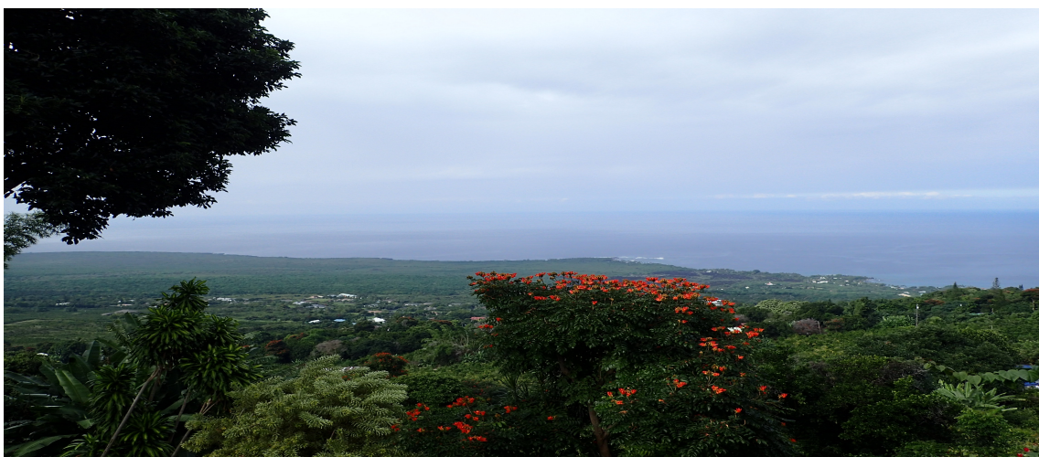
View to Captain Cook area from the Coffee Shack