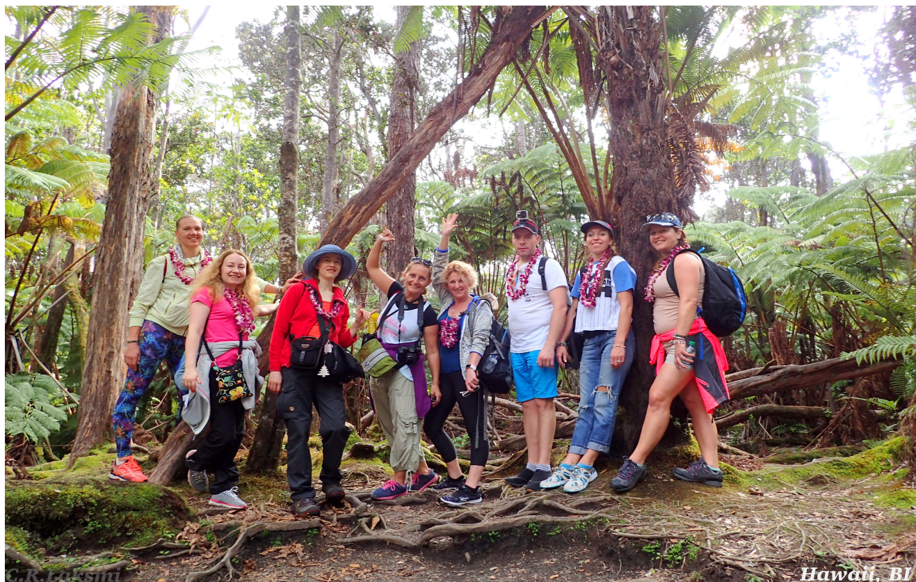
Aloha from the adventure group of 2016 in Hawaii

Early morning ocean swim and finalization of the group after the swim on the beach in the circle. Quick bite for lunch from the local grocery store. Packing and check out from the hotel by noon. Final shopping in Kona. Dinner in Kona and aloha hugs!