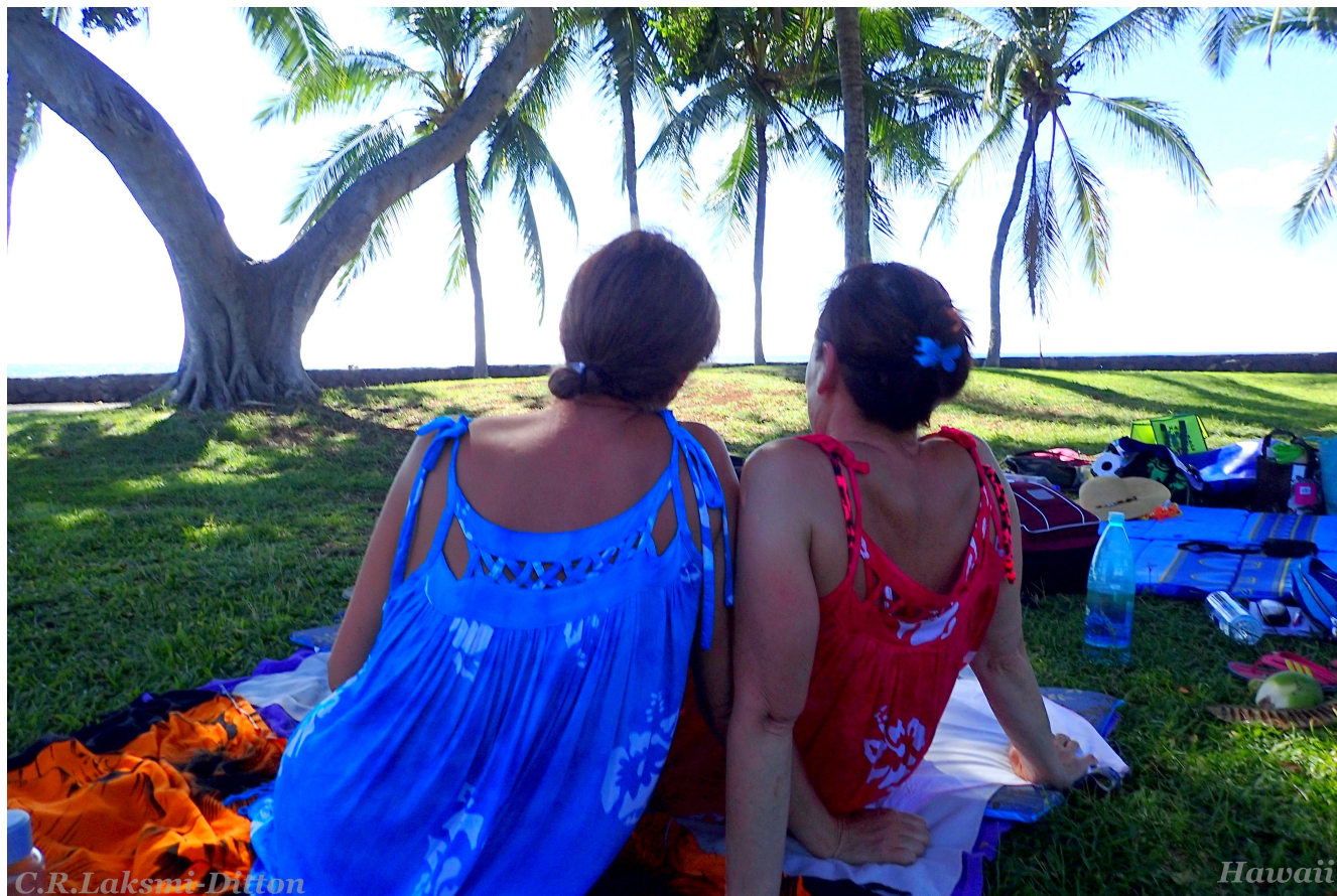
The best classroom in the world!

We will have a little Aloha University hour under the palm trees where I introduce the Hawaiian worldview about relationships, abundance and their spiritual worldview. We also will do some interactive exercises and movements to understand it all and experience how to implement it during our adventure.